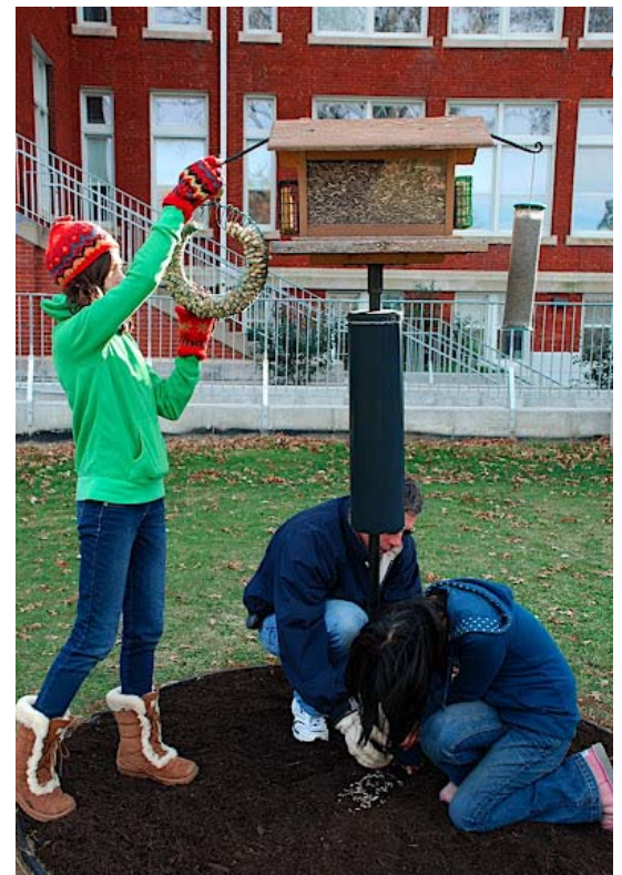
Young birders installing a feeding station at Indianola School in October 2010.